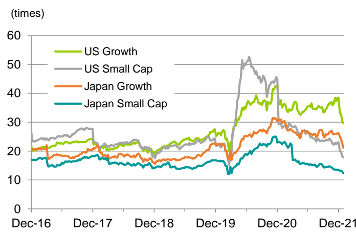
Figure 4. Japan/US indices Price to Earnings

Source: MSCI, Bloomberg, as of 28th January 2022, 1 year Forward Price to Earnings