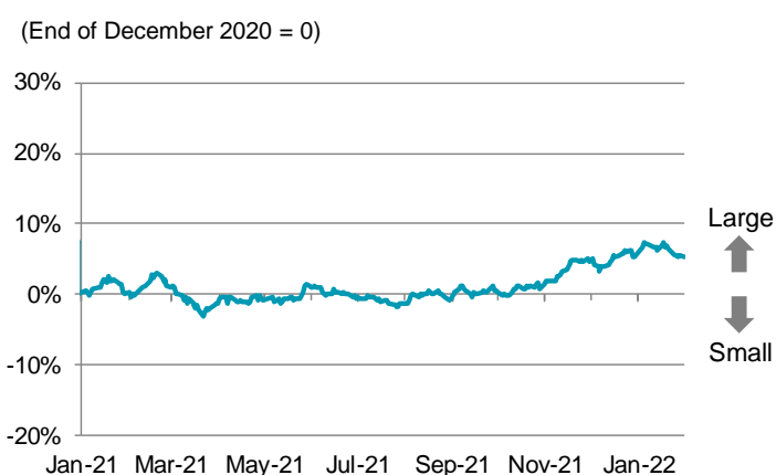
Figure 2. Size: Large-Small Cap Spread

The spread between the Russell/Nomura Large Cap Index and the Small Cap Index (Positive figure means Large Cap dominant), as of 31st January 2022