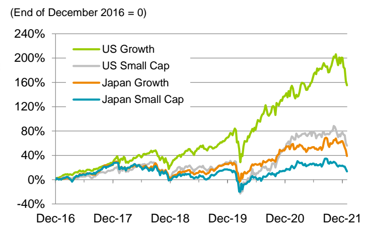
Figure 3. Japan/US indices return