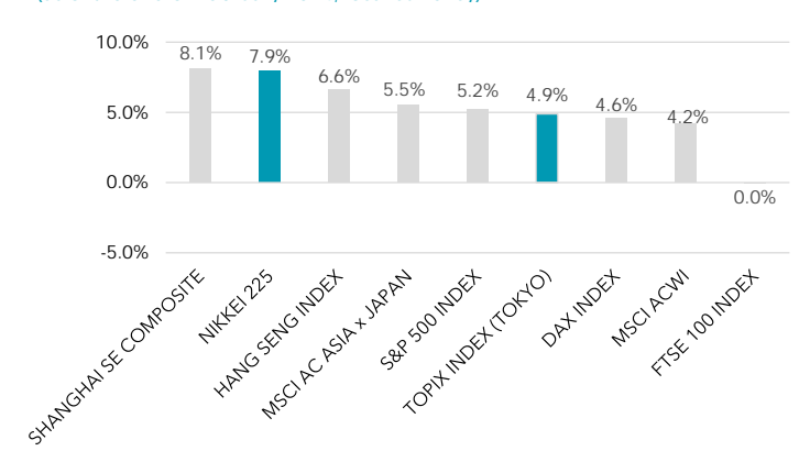
TABLE 3. BOTTOM 5 PERFORMING SECTORS