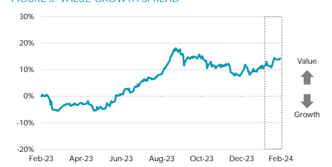
FIGURE 3. VALUE-GROWTH SPREAD

Note: The spread between the Russell/Nomura Value Index and the Growth Index (Positive figure means value dominant)