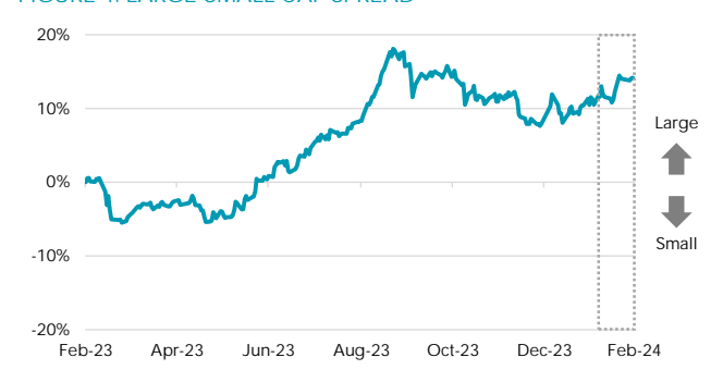
FIGURE 4. LARGE-SMALL CAP SPREAD

Note: The spread between the Russell/Nomura Large Cap Index and the Small Cap Index (Positive figure means Large Cap dominant)