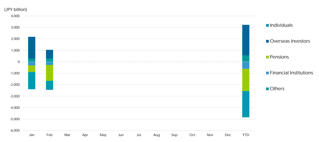
FIGURE 6. MONTHLY INVESTMENT ACTIVITIES BY INVESTOR TYPE IN THE JAPANESE EQUITY MARKET**